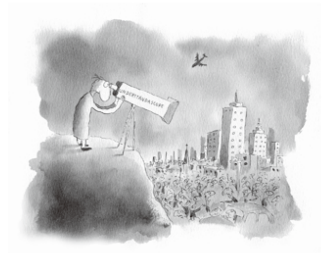
Figure 1. "Understand - a - scope", courtesy of Mr. Michael Leunig, author of this cartoon

rubbish, from cans to bags and food. There were piles of rubbish next to a few bins that lined the beach, but clearly these were not enough. Stray dogs and cats picked through the waste, and the out-going tide carried this chaos onto the precious reef. In that moment at age 11, I knew that what I was experiencing was not right. People loved their environment to death through not understanding the impacts of their ways. I studied environmental engineering at university for my undergraduate degree, then rapid curriculum renewal for my doctoral studies.